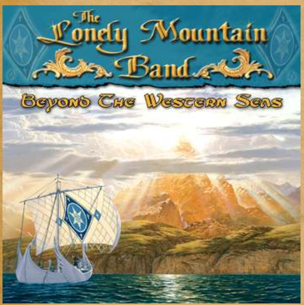
"Beyond the Western Seas" album cover – artwork by Ted Nasmith