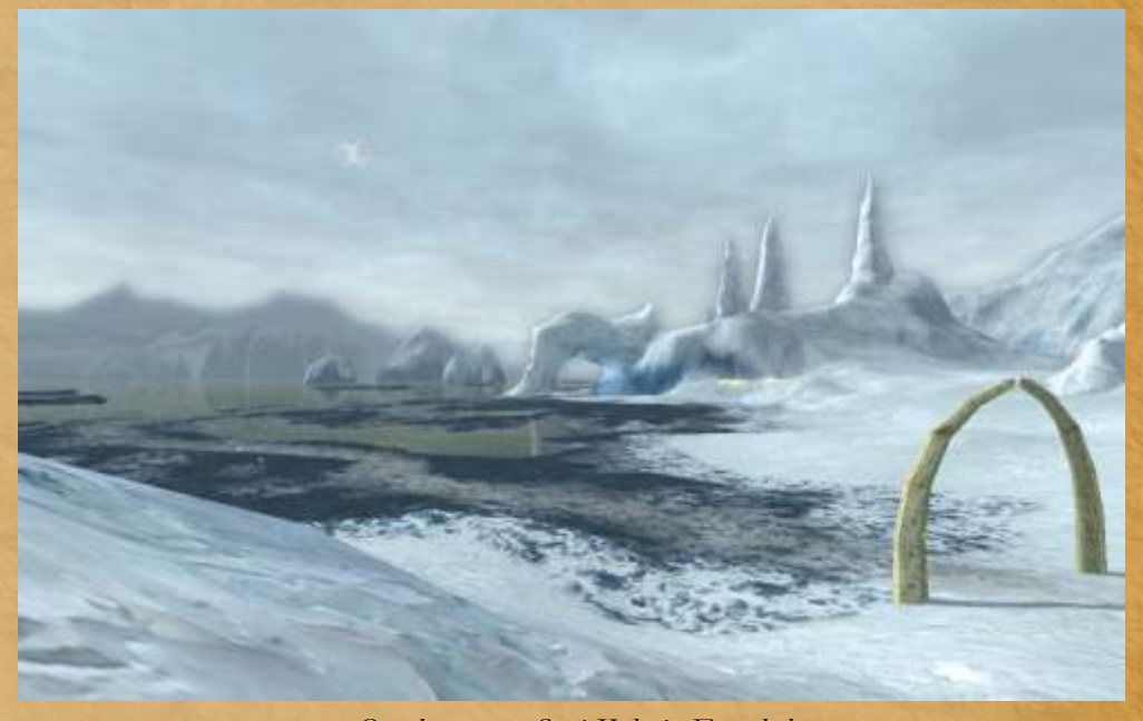
On the way to Suri-Kyla in Forochel

This cozy Trestlebridge home has recently come onto the market. Don't let the missing shingles fool you – this three bedroom bungalow is free of any fire damage and located on the highly desirable south side of town. From the front door, it is a quick walk to the market or only a brief pony ride for a day of shopping in Bree. As a bonus feature it is located just outside the southern gate, so the tiresome noises associated with the center and north sides of town can barely be heard. For more information contact the owner, Giles Chadwick, for a tour. He is available most days unless called to the general defense of town. Priced to sell at 2.2 gold! •