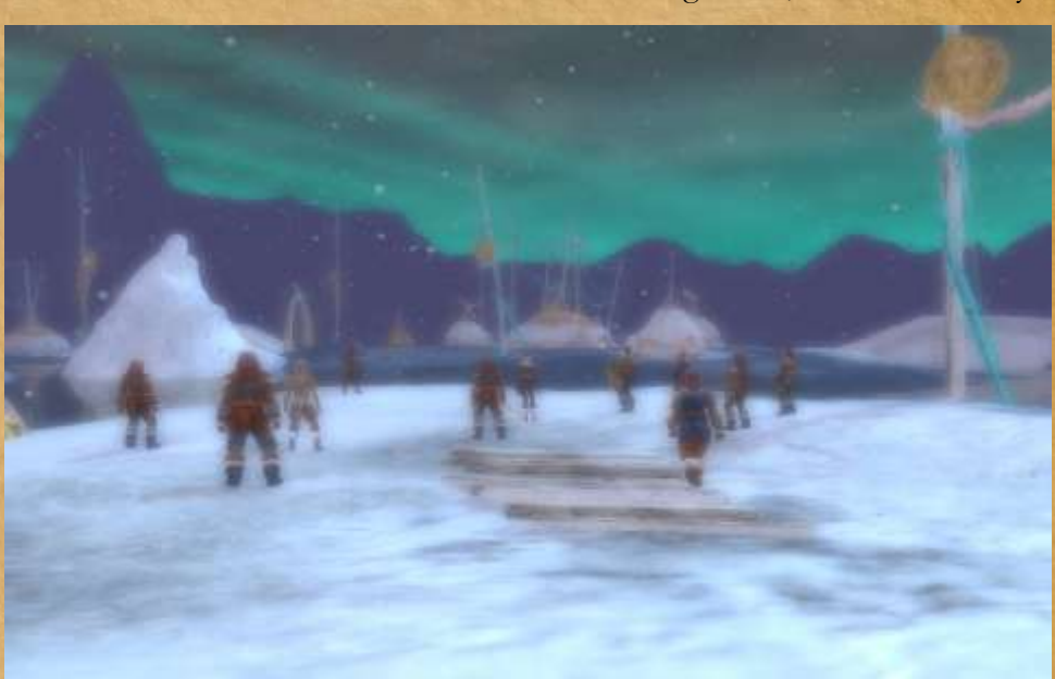
Lumi-väki assembling for a ceremony

Inside, with only the glow of the dying embers for light, the drumming starts, soft and slowly