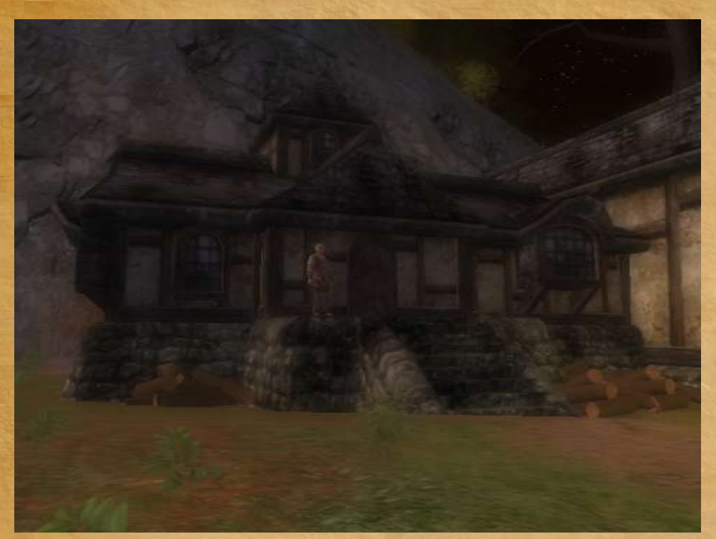
Cozy Trestlebridge cottage now on the market.