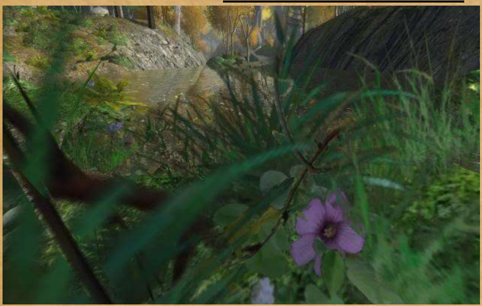
Hobbit's Eye View of Lothlorien by Merrydew