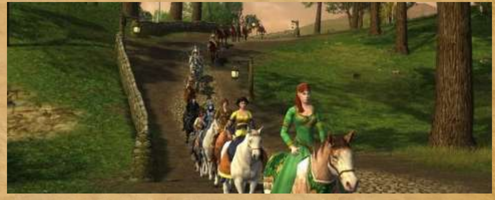
The Fellowship's Walk - For the Children of Middle Earth