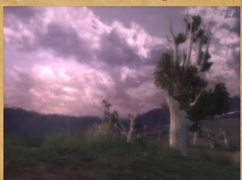
Fluttering of a Thrush